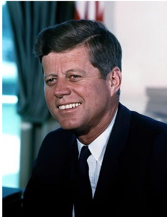
John F. Kennedy - America's first Roman Catholic president