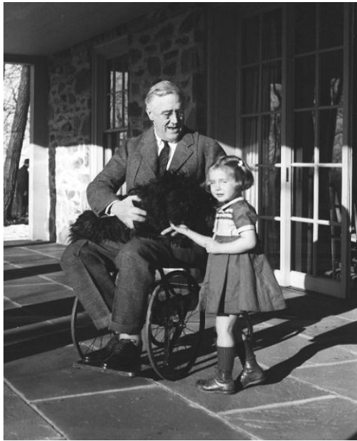
Franklin D. Roosevelt in his wheelchair in 1941