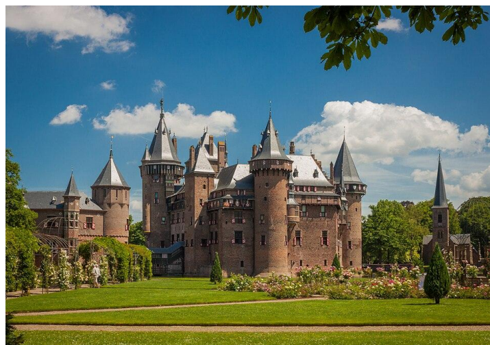
De Haar castle, Utrecht, The Netherlands