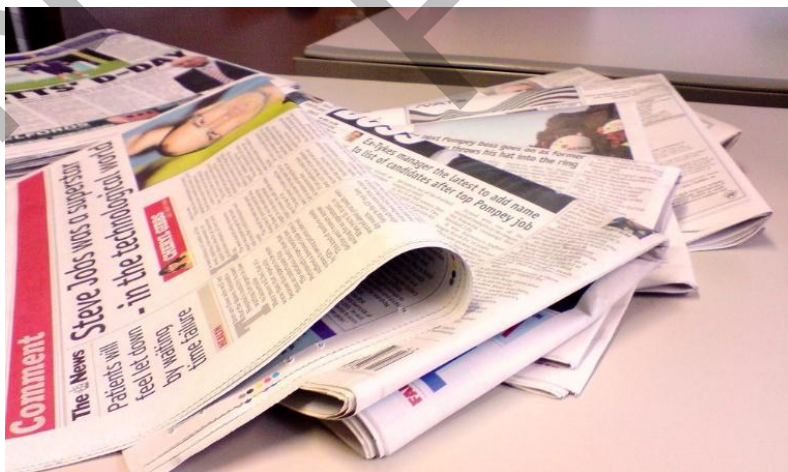
"Newspaper colour"