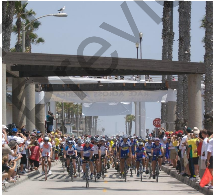
" Race across America " by Kayvz at English Wikipedia is licensed under CC BY 2.5 .