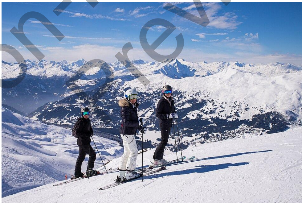
Skiing in Lenzerheide, Switzerland

However, if winter tourism must be done in a way that protects nature. Alpine countries are using green energy for ski lifts, eco-friendly building materials, and encouraging responsible tourism to protect the nature.